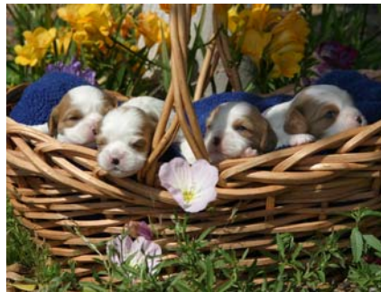
Look what the Easter Bunny brought Eileen Starks—a basket full of puppies!