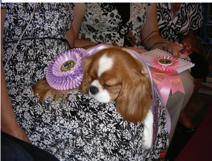
Sashay say's "being beautiful is sooooo exhausting sometimes!"