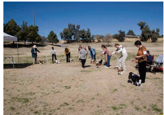
All lined up and ready to show!